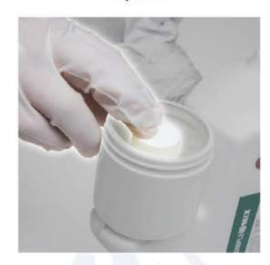
5) Slowly swirl for 15 seconds.

Firmly push small, inner container all the way down.