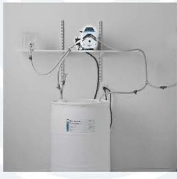
9) Re-start pump and mix 15 minutes. 10) Stop pump.