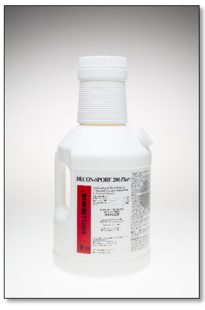
1 Gallon SimpleMix, DS200-04A