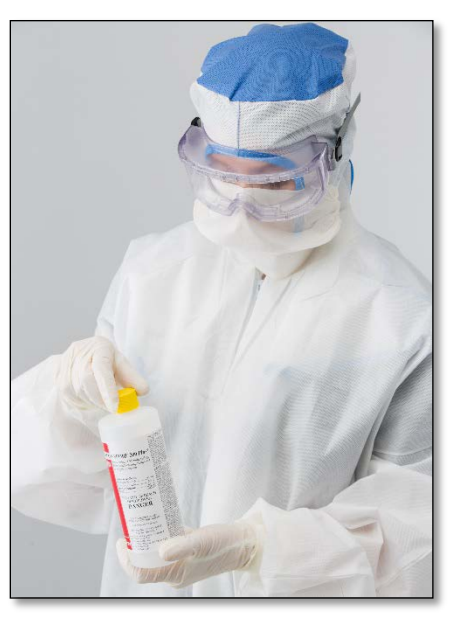
Opening a DECON-SPORE 200 Plus 13 oz Container

The test material is classified in EPA Toxicity Category III by oral administration.