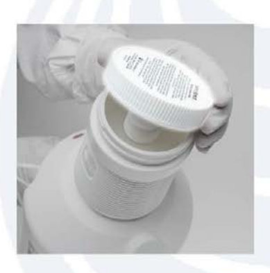
Open small side spout and peel off inner seal, as above.