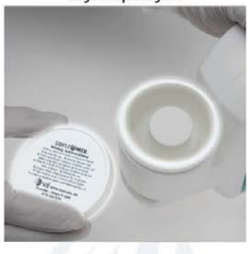
4) Replace cap and tighten.

To prepare use solution, open cap. Peel off inner seal by grasping tab at far edge and pulling off.