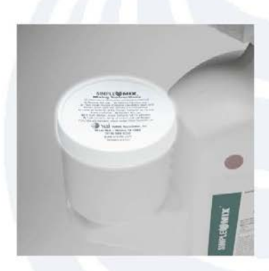
6) Move spray nozzle to open position.