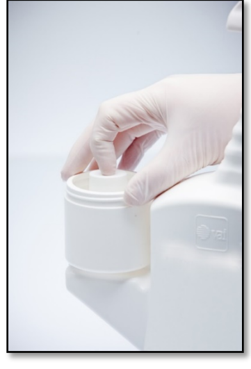
16 oz SimpleMix Container