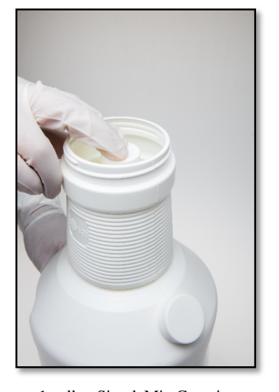
1 gallon SimpleMix Container