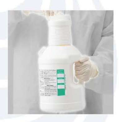
Pour solution from small side spout onto surfaces to be treated or alternate containers.