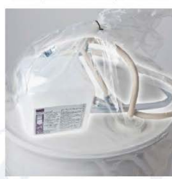
5) START pump to empty cubic container. 6) When cubic container is empty, turn pump OFF.