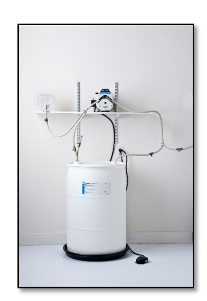
200L Drum SimpleMix Container