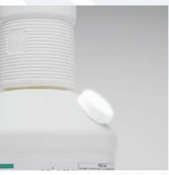
8) Follow directions for use on label.