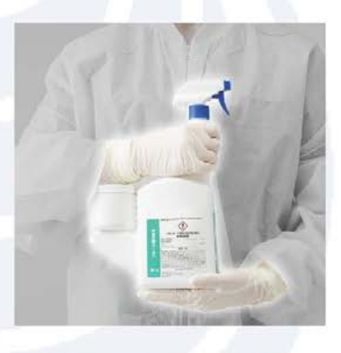
7) Follow directions for use on label.