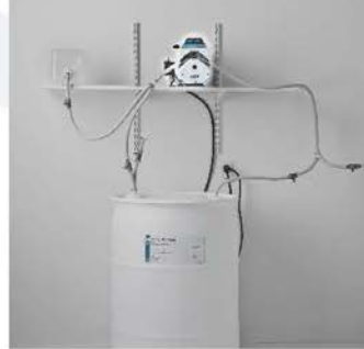
13) Follow directions for use on label.