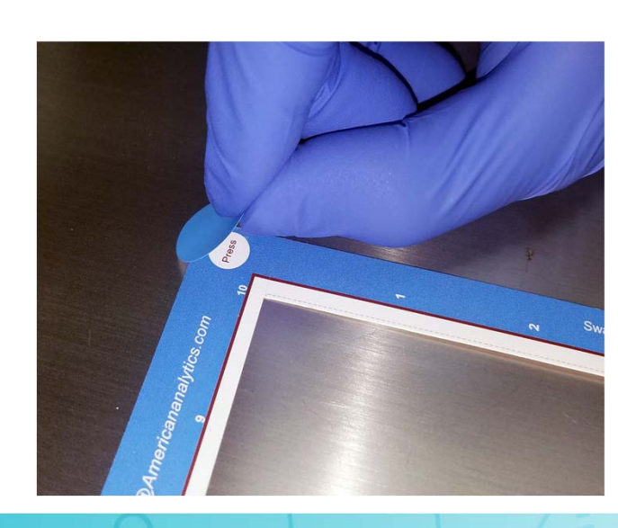
Figure: Applying the adhesive dots to position frame onto the intended wiping surface.