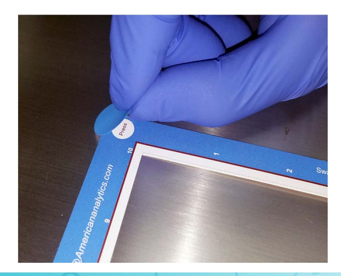
Figure 6: Applying the adhesive dots to position frame onto the intended wiping surface.