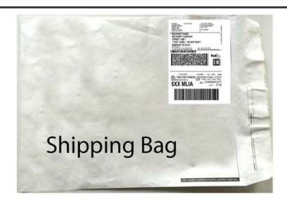
Figure 2. Overview of Items shipped back to the laboratory.

Labeled sample containers and their completed Data forms, all inserted in the new return bag, and placed in the original shipping box.