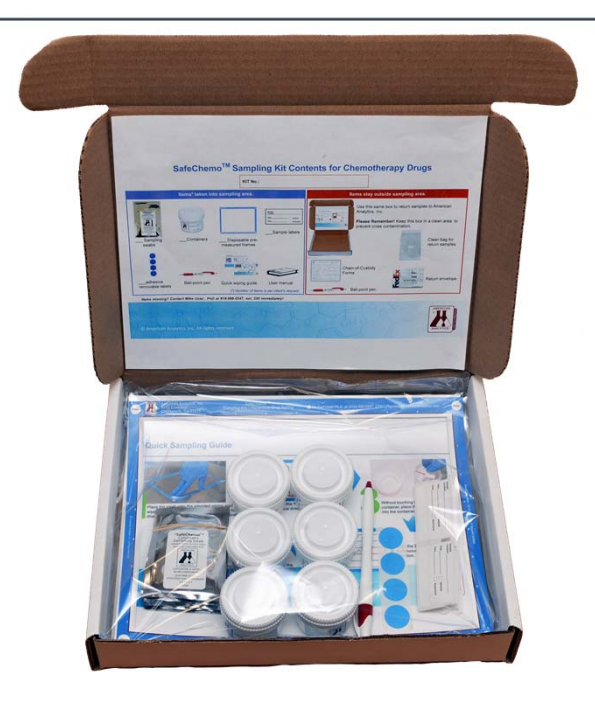
Figure 1. Overview of the sample kit box upon reciept